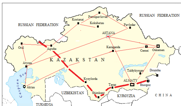
Figure 2. Scheme of the transport and logistic system of Kazakhstan

The program includes 11 projects of a road industry. In general, more than 7, 000 km of roads connecting Astana with the large logistic centers in Almaty, Ust-Kamenogorsk and Atyrau will have been reconstructed and constructed by 2020. The same highways will connect regional transport hubs in such cities as Aktau, Pavlodar, Kostanay, Semey, Aktobe, Atyrau, which are key points of freight distribution on the Russian and Central Asiatic markets (Fig. 2).