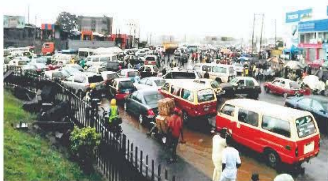
A section of Iwo Road.