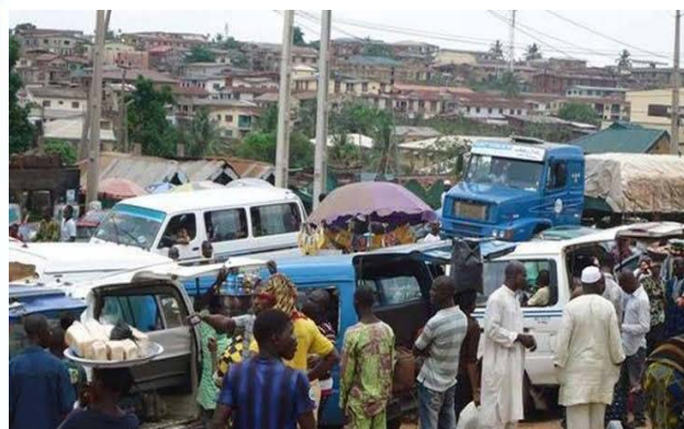
Figure 3. A section of Beere/Yemetu-UI/Ojo road showing unguided packing activities and road encroachment