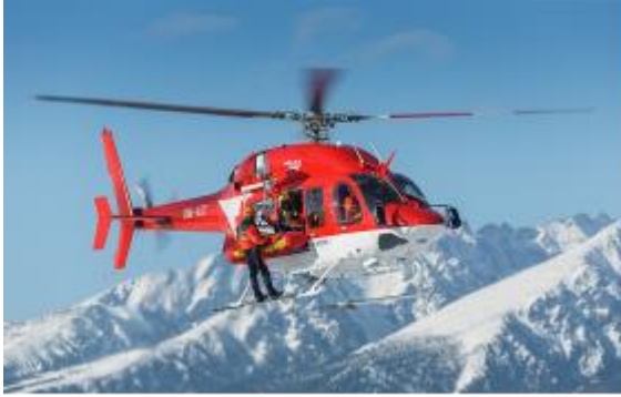
Figure 1 - Helicopter Bell 429

The Bell BasiX-Pro Integrated Avionics System concentrates on providing true operational capabilities and flexibility to our customers to address rapidly changing regulatory requirements and technologies, with an open architecture and flexible avionics systems solutions. The enhancements available for the Bell 429 through optional accessory kits and customizing include the Traffic Advisory System and Helicopter Terrain Awareness and Warning Systems / Enhanced Ground Proximity Warning System. [4]