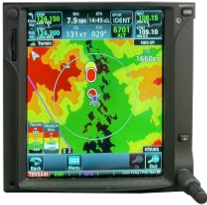
Figure 4 - Detailed HTAWS screen on Garmin G750 during test flight.

e) Recognition of terrain and other significant obstacles by the onboard HTAWS system and comparison with visual contact, (figure 4) or evaluation of deviations or changes in the underlying maps of the system.