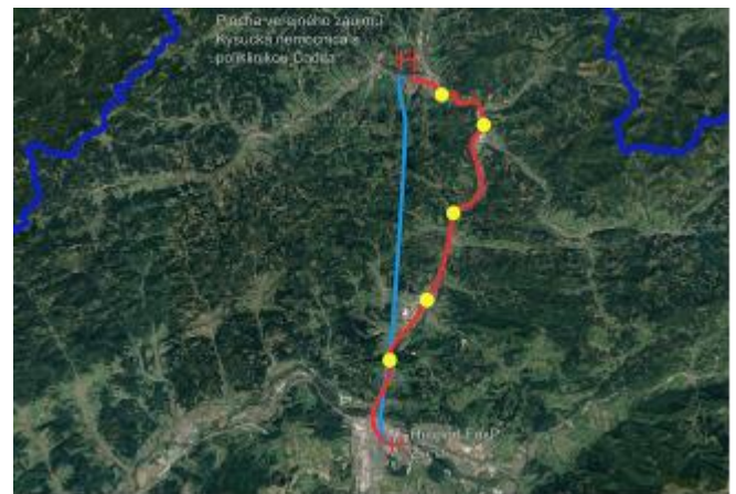
Figure 3 - Designed route for corridor compared with direct flight route

In figure 2 is the line shown in blue, which is mainly used by the crews of HEMS Krištof 06 for the direct flight to the hospital in Čadca and also back to Žilina. The red color shows the route that would ensure a safe flight even under the minimum limit values for VFR or SVFR flight, namely 600 ft AGL with a minimum flight visibility of 800 meters. Individual control critical points are shown in yellow.