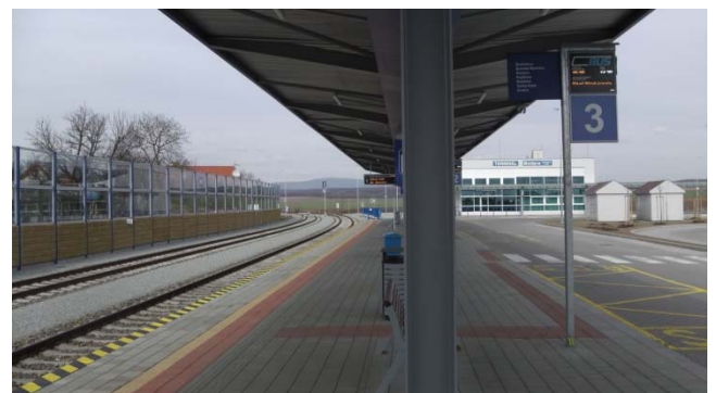
Figure 2. Integrated passenger transport terminal in Moldava nad Bodvou mesto, Slovakia [8].

In central Europe, there is a modern trend of establishing integrated passenger transport systems in selected regions. Cores of these systems are terminals, where passengers can change vehicle and also the mode of transport, for example get off the bus and get on the train. These terminals are hubs, whence all routes and lines from some region or district are connected. Building these new terminals will improve transport accessibility in the selected region. Operators, who participate in the integrated passenger transport system, are more effective and notice increased demand for transport services.