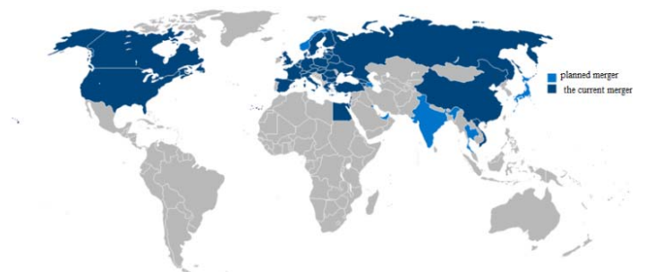
Figure 3. Planned and current merger [8].