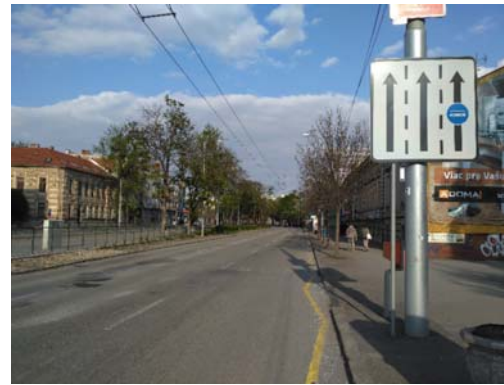
Figure 2. BUS lane in Štúrova street

This section with BUS lane is located on the southern part of the Štúrova Street. Links from the west and south of the city to the city center go there. Lines 10, 11, 15, 16, 20L, 21, 23, 25, 32, 52, 56, 71 and 72, as well as night N2, N3, N4 and N6, pass through this section.