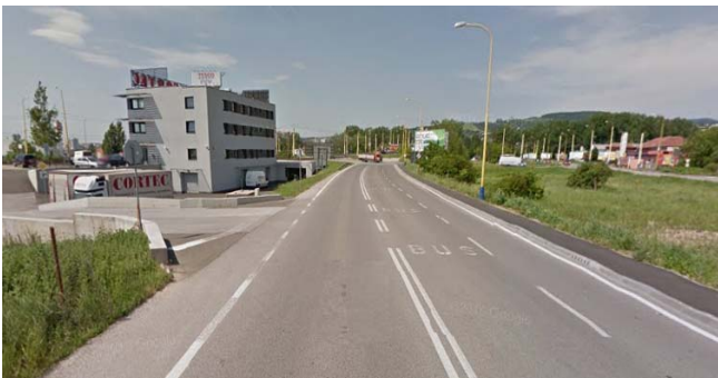
Figure 1. BUS lane in Magnezitárska street

The section is located after the bus stop EcoPoint on the Magnezitárska Street. DPMK came up with a suggestion to divert on the morning transport peak of bus lines 18, 27, 36 through the village of Ťahanovce. The original route between bus stops Sofijská (last stop on Sídliisko Ťahanovce) and Tesco, Džungľa was 1.5 km long. The new route was extended to 4.4 km, but even with such a significant increase in mileage, time savings were higher.