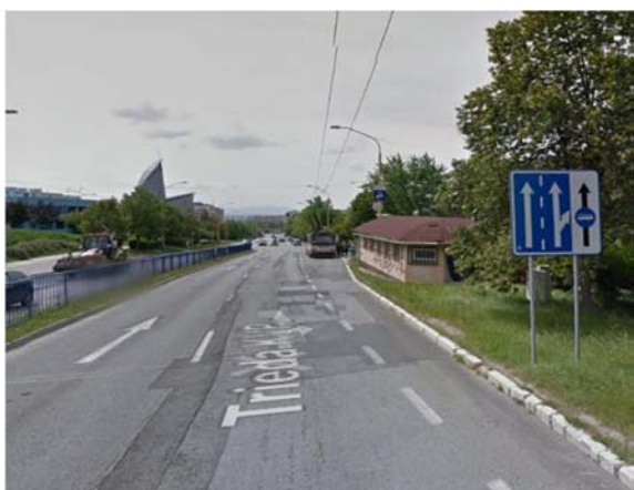
Figure 5. BUS lane in Trieda KVP

A separate BUS lane starts just for the bus stop Miestný úrad KVP and ends before the crossroad. At the end of the BUS lane is placed, on the traffic light, a separate signal for buses („balls lights“).