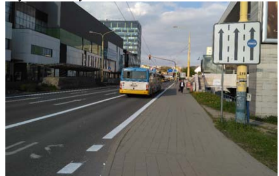
Figure 3. BUS lane in Štúrova street

A separate lane for buses (BUS lane) is located on the southern side of the Štúrova Street. It is located on the right side of the road and its start is before the bus stop Dom Umenia and ends at the stop of the bus stop Námestie osloboditeľov, behind the traffic lights. Its total length is approximately 670 meters. This BUS lane is an important element in a given segment, helping to moderate the already high delays in the city center.