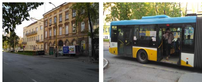
Figure 6. Wrong placed bus stop Jakabov palác

The big disadvantage is that in the city Košice there is practically no combined stop for tram and bus transport, although the possibility of a realization of such a stop was here at that time. Shared stops in the city center would certainly help to increase the attractiveness of public transport. The only one effort to build a shared stop was the "Spoločenský pavilón" on Bardejovska Street. However, this stop is mostly used for bus transport. Trams use this stop only they are returning to the tram depot. Bound with the MET stage 2 project, however, there is a reconstruction of the track in this area and the stop Spoločenský pavilón should be already built as a combined stop at the Trieda SNP. [9]